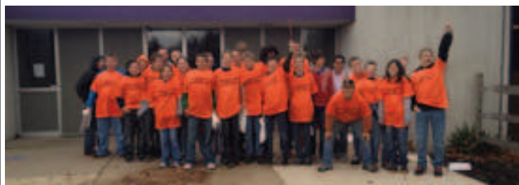
Project Lead the Way students are excited upon returning with knowledge about construction careers gained during their field trip.

For the first time, this year Blissfield Middle School is offering a high school credit for a Project Lead the Way course entitled Introduction to Engineering and Design. During class students use Autodesk Inventor to create and look at the world of Engineering. While discussing the design process and how important it is to think differently students are also fortunate to attend the "JUST BUILD IT" Career Expo held at Eastern Michigan University, where they were gained insight into career possibilities. The expo featured live demonstrations and hands-on activities presented by engineers, architects, and skilled tradesmen. There were also exhibits by construction firms, colleges, and universities.