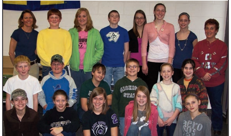
Student Council Members:

As a whole, the middle school collected approximately 67 lbs of pop tabs for the charity. Keep up your generous nature Royals!